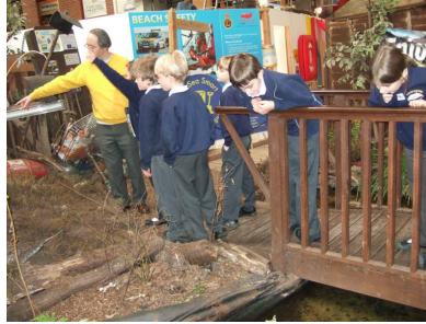
At Streetwize the children learned about personal safety in the garden, on the beach and in the house.