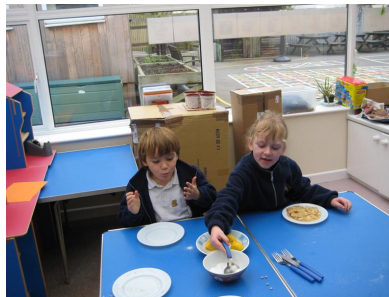
Choosing the pancake toppings - a chance to try out some new ones.