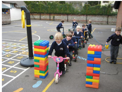
Reception built garages and practised 'parking'.