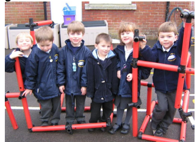
Reception used large construction equipment to erect buildings.

We're collecting Tesco, Flora and newspaper tokens for free books. Do drop any that you have into the school. We can make excellent use of them. Thank you for the ones that we've had already.