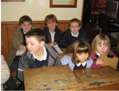
The Priest House museum in Wimborne was an opportunity to experience life in a by gone time.

We've had lots of trips this half term and here are a few to give you a taster of our term :-